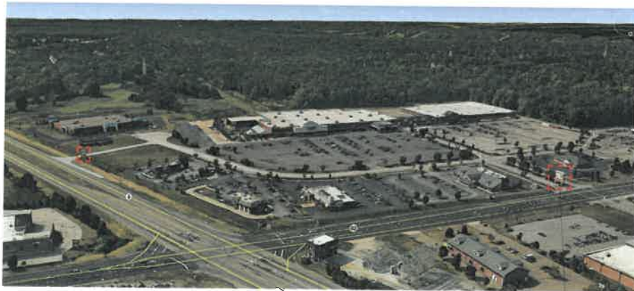
NORTH AERIAL VIEW INTERSECTION OF OH-8 AND E AURORA RD