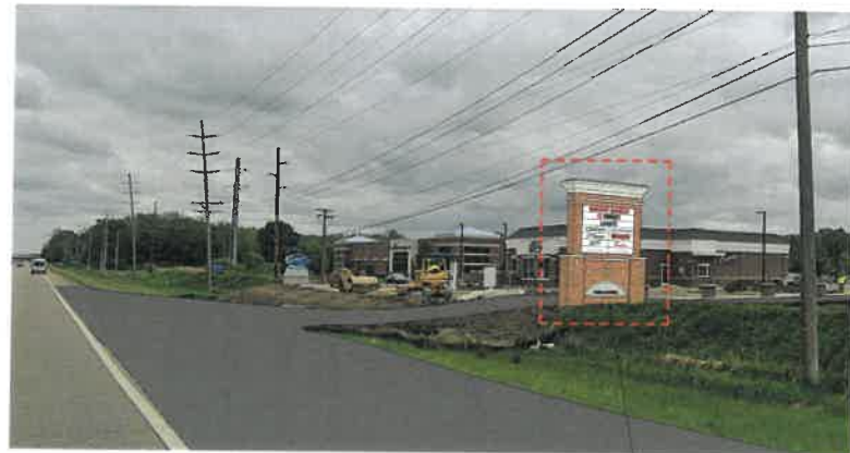
NORTH PERSPECTIVE VIEW OH-8