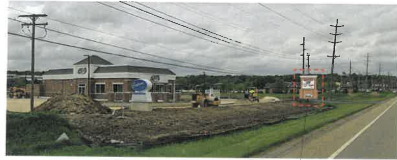
SOUTHEAST PERSPECTIVE VIEW OH-8