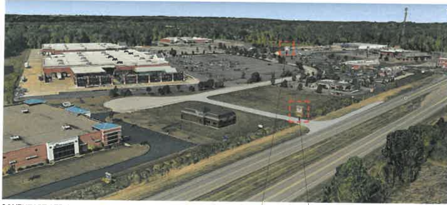
SOUTHEAST AERIAL VIEW OH-8